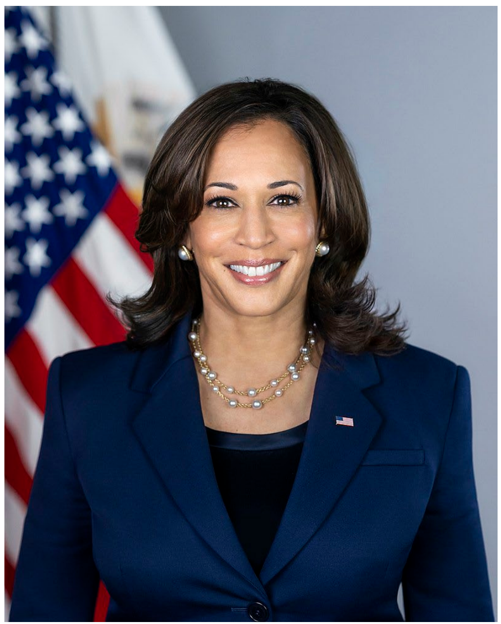
What job or political office is now held by this person? [TEXT BOX 40 CHARACTERS]